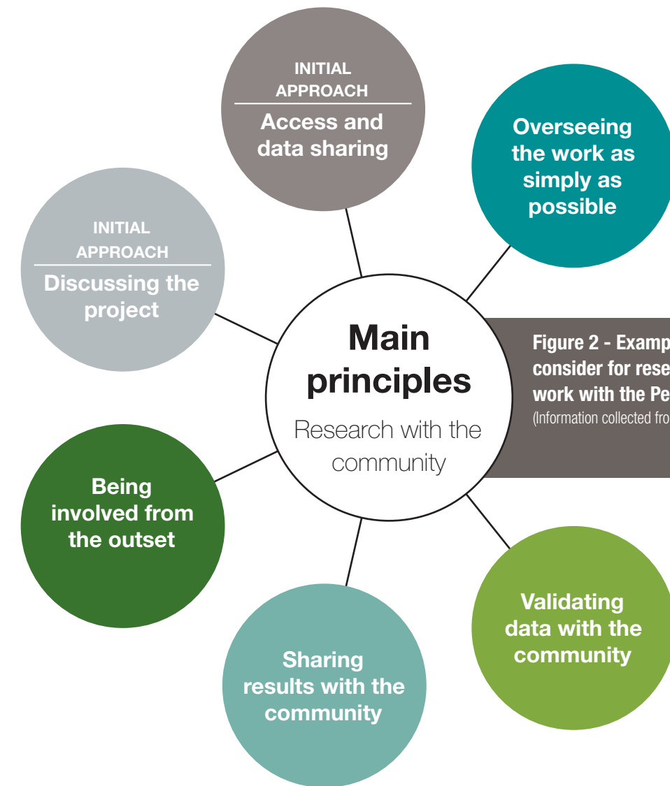
Figure 2 - Examples of principles to consider for researchers who wish to work with the Pessamit community. (Information collected from a workshop held March 21, 2019)